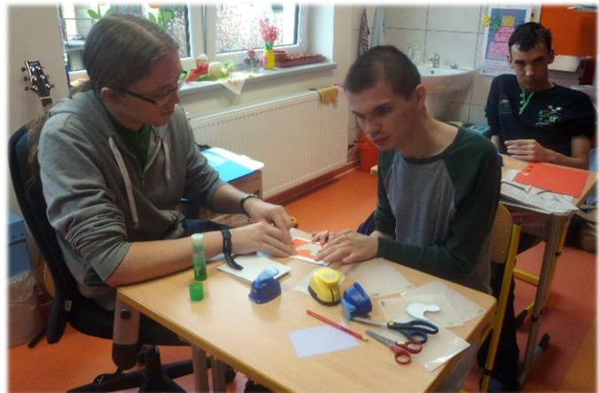
Secondary school in Český Těšín

Kindergarden is attended by children aged 2 – 7 with mental disabilities, autism spectrum disorders, communication and speech impairments, physical disabilities, multiple disabilities and other impairments.