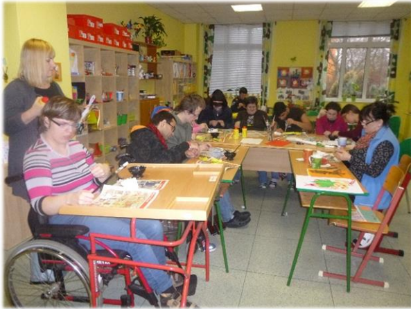
Secondary school in Bohumín

You will accompany and assist immobile pupils during movements within the school premises and during trips and events organized by the school. You will assist teacher and pupils during lessons and