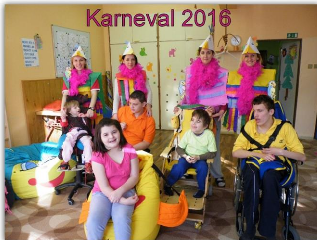
Primary school in Bohumín

Primary school offers education to pupils aged 6 – 26 with moderate, severe and profound mental disabilities, as well as to pupils with autism spectrum disorders.