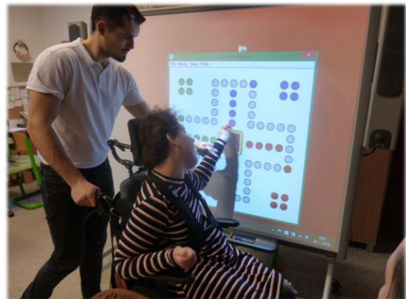
Primary and secondary school in Karviná

educational programmes adapted for pupils with special education need such as drama activities, art lessons, dressing trainings, walks, locomotor skills games, working with interactive board, working on PC, singing, listening to relaxation music, you will help pupils to play musical instruments. You will have an opportunity to work with educational tools adapted for children with limited fine motor skills. You will talk to pupils, listen to them, assist during conflicts among pupils, and help them to develop their social skills. You will supervise the safety of children and their behaviour, help pupils to do their homework and assignments, accompany pupils to physiotherapy