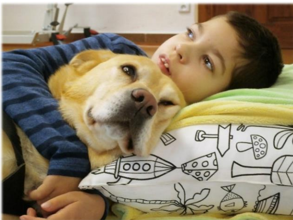
Primary school in Ostrava

This flat is usually shared by two volunteers. The journey from the flat to school will take you at about 10 minutes. As for the volunteers working in a school in Ostrava and Bohumín, they usually live in a flat in Bohumín. This flat is shared by four volunteers, each of them has its own room. Kitchen and bathroom are shared. Volunteer working in Ostrava travel to the school at about 40 minutes. As for the volunteers from Český Těšín, accommodation will be specified later.