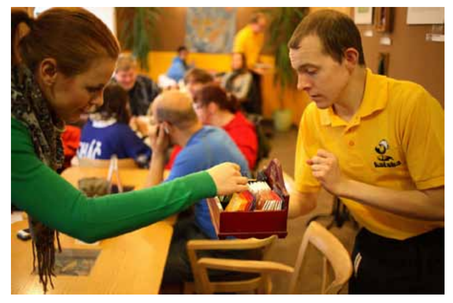
Center of Diakonia ECCB

These three main lines would also support the goals identified by the Special Committee '500 Years of Reformation' by providing tools for the implementation of the subthemes of the celebration in different European Contexts. (See p. 40 for more about the Reformation Anniversary)